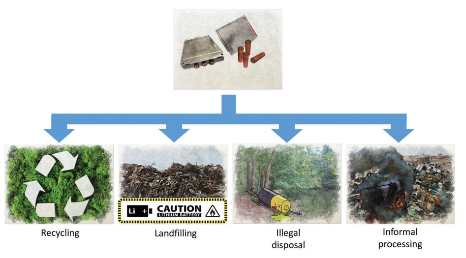
Fig. 1 Disposal routes of LIBs.

collection and recycling schemes.9 As a result, human health and environmental quality could be placed at risk as a wide range of pollutants could be released like heavy metals or hydrofluoric acid (HF) when batteries are disposed of inappropriately.